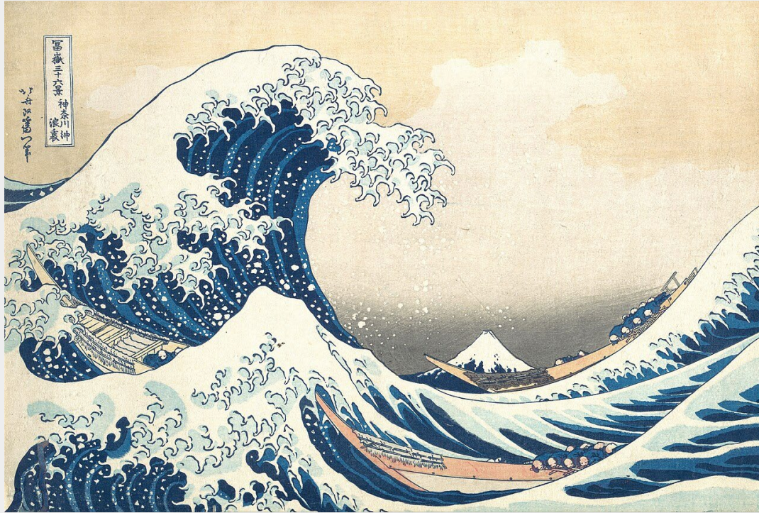
Under the Wave off Kanagawa or The Great Wave Katsushika Hokusai 1830-1832